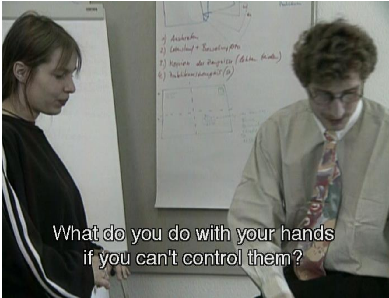
'The Interview' (Harun Farocki, 1996)