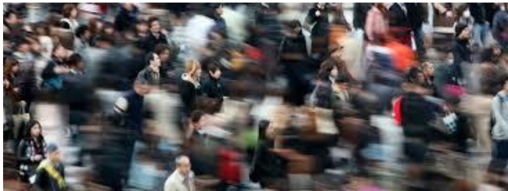
Stills from 'Welfare' (Frederick Wiseman, 1975)

This list was a very simple thing, a checklist, something to be worked down with a highlighter and Biro, but it also seemed to refer to something unimaginably complex - a whole world of lives and troubles and situations about which I knew next to nothing.