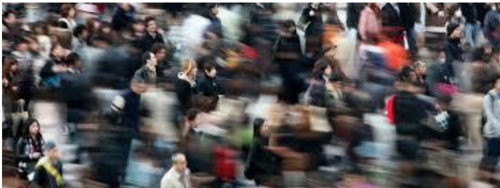
Stills from 'Welfare' (Frederick Wiseman, 1975)

This list was a very simple thing, a checklist, something to be worked down with a highlighter and Biro, but it also seemed to refer to something unimaginably complex - a whole world of lives and troubles and situations about which I knew next to nothing.