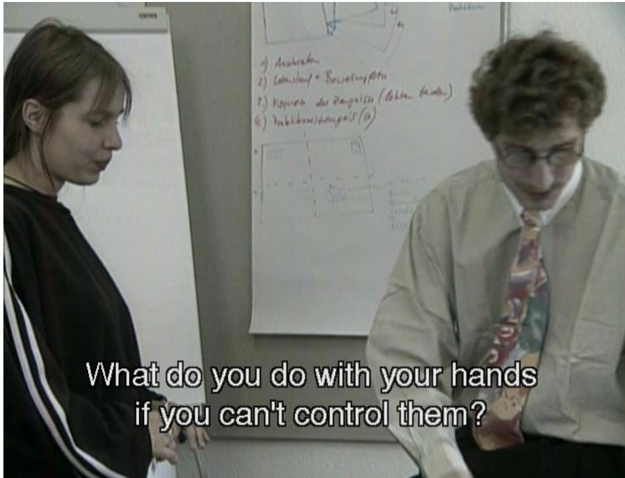
'The Interview' (Harun Farocki, 1996)